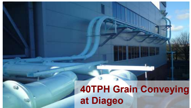
40TPH Grain Conveying at Diageo

Test Equipment Includes: 80m pressure or vacuum pneumatic conveying system, 6" screw feeder, small vibratory feeder, access to other equipment where required.