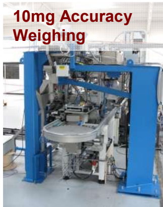
10mg Accuracy Weighing