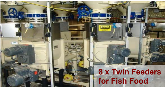
8 x Twin Feeders for Fish Food