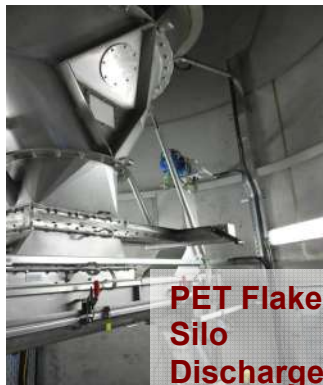
PET Flake Silo Discharge