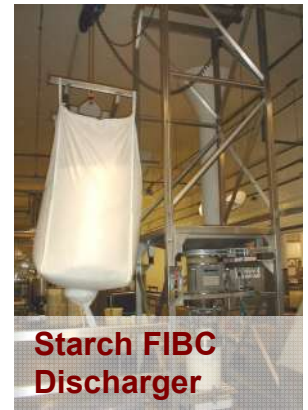
Starch FIBC Discharger