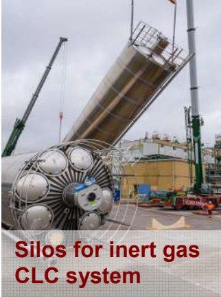
Silos for inert gas CLC system

Examples of our specialist & bespoke projects. Call us today for more information +44 (0)1858 410737