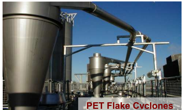
PET Flake Cvclones