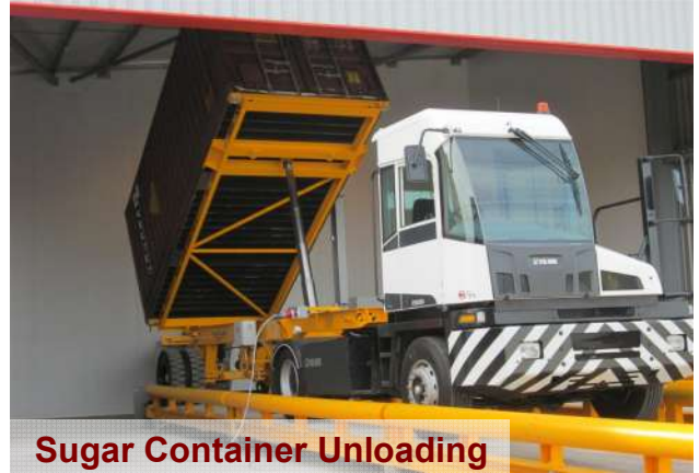
Sugar Container Unloading