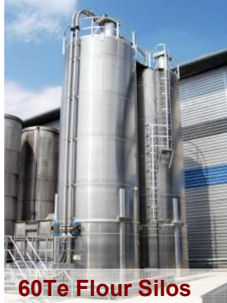
60Te Flour Silos