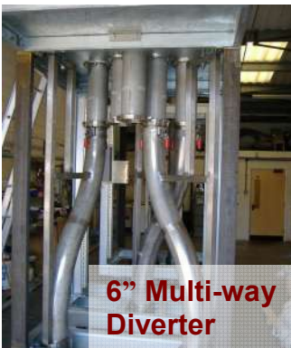
6" Multi-way Diverter