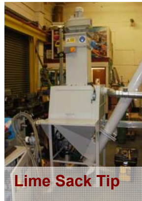
Lime Sack Tip